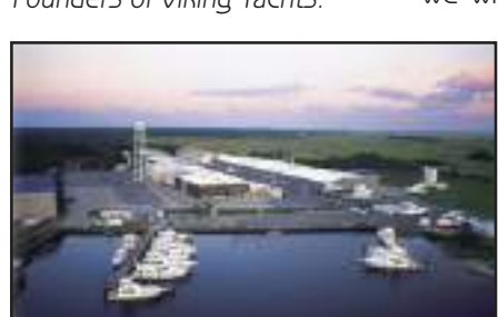
Viking Yacht Company

This is our Headquarters, situated on the Bass River, in New Gretna, New Jersey.